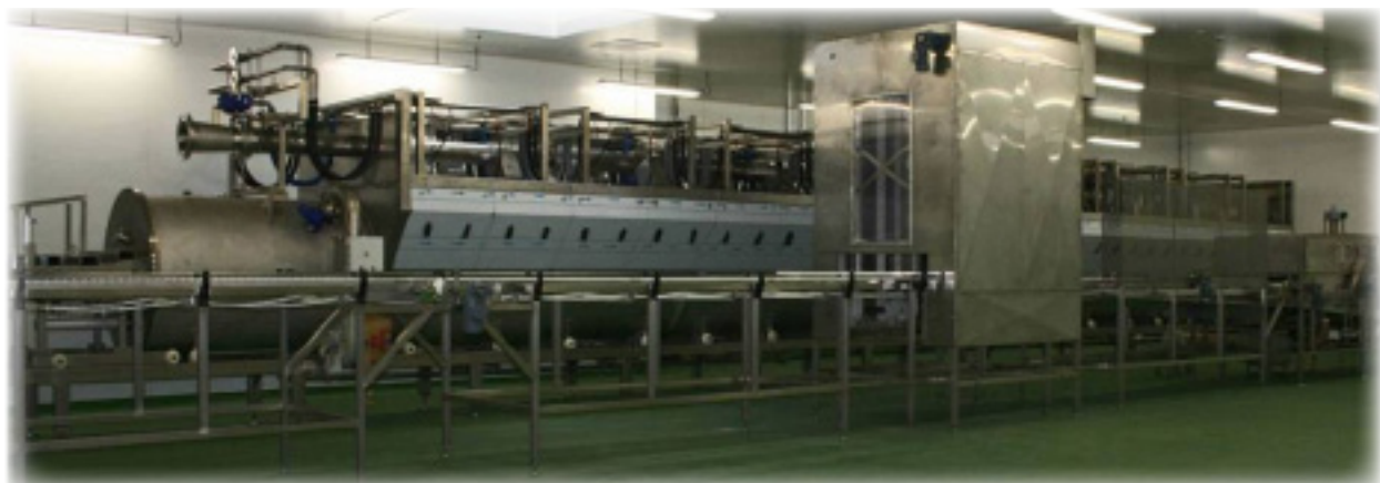
Photo Above: MIVAP™ Industrial Line for the production of instant soup